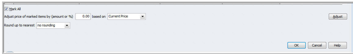
Figure 3: Click the box next to Mark All if you want to change the prices of all entries.

Once you've selected the right type, click in the column next to the item(s) you want to change. A check mark will appear. If you want to increase or decrease the prices of all of them, click next to Mark All at the bottom of the screen, as pictured in Figure 3 .