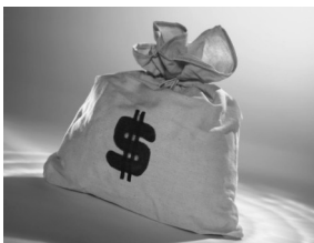
Life's a little easier with Earned Income Tax Credit.

The Earned Income Tax Credit (EITC) is a refundable credit for "working people, not cheats and scam artists". The EITC can be a very generous credit to those that qualify; it is also a widely abused credit.