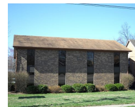
View of our new office building that faces Bardstown Road.