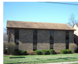
Our new Office Building!

Our new building is a whopping 3,108 square feet on two floors. We have a total of 12 offices, a kitchen, two bathrooms, a waiting area and a large conference area. The larger space will allow us to hire additional staff to serve you better.